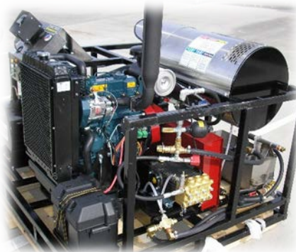
Whitco 5050 DPO (right)