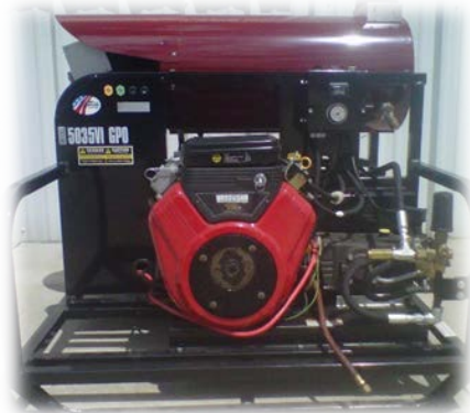
Whitco 5035 IV GPO (left),