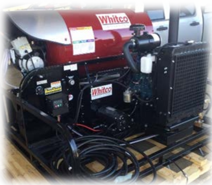
Whitco DPO 1030